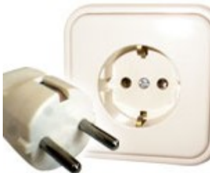
Type F: This socket also works with plug C and E

Your need for a power plug adapter depends on the power plugs used in your own country.