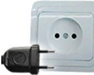
Type C: This socket also works with plug E and F

In South Korea the power sockets used are of type C and F. Check out the following pictures.