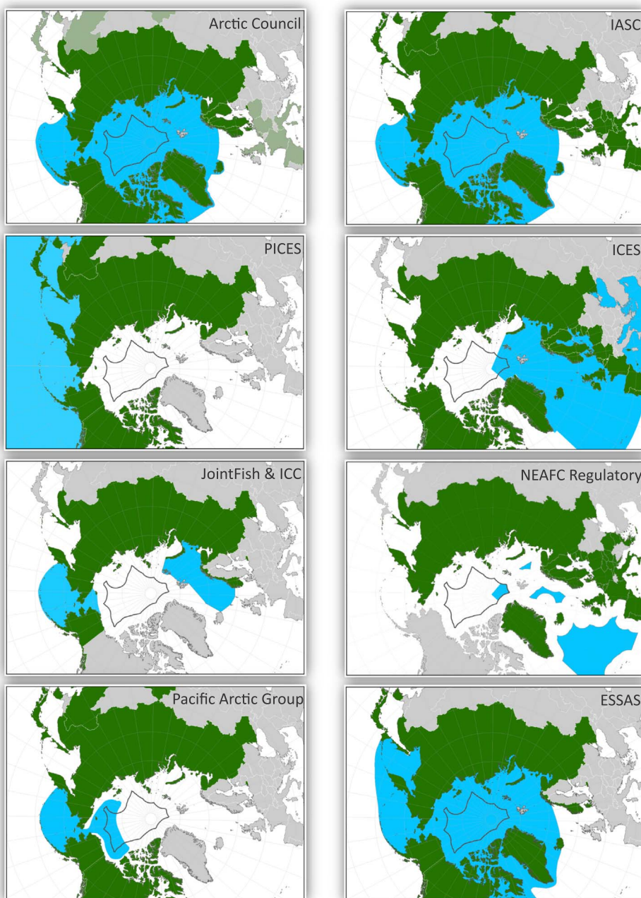
Fig. 2. Maps for each of the major marine research organizations or programs active in the CAO region and adjacent waters, depicting the marine spatial coverage or focus region in blue, and the member states in green. Lighter green represents a secondary tier of membership, e.g. “observer” status for the Arctic Council. See Table 1 for full names. JointFish and ICC are combined in a single panel for convenience; JointFish is the marine area on the right side of panel, with Norway and Russia as corresponding member states, and ICC is the marine area on the left side of panel, with Russia and the USA as member states. Note that depiction of marine coverage is for illustration purpose only—boundaries are not exact.

In addition to top-down coordination efforts led by governments, i.e. the FiSCAO meetings and the WGICA process, an array of more “bottom up” efforts is growing, in the form of groups that span the