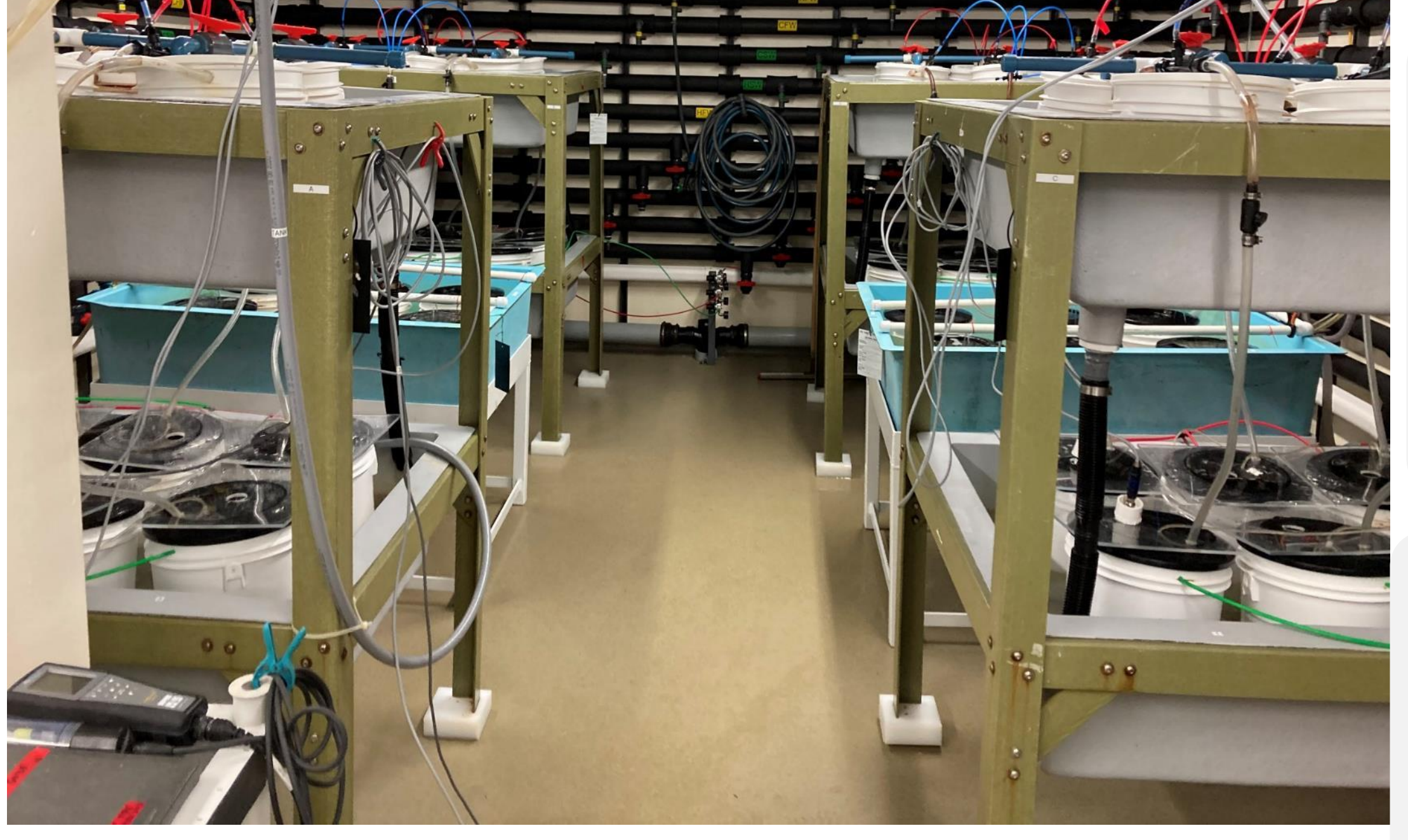
Figure 3. FOCCOAL

Acute stressor events in marine environments are increasing in both duration and frequency due to climate change. Of particular concern are heatwaves, which can lead to a range of detrimental impacts, most notably the mass die-off of marine shellfish. In addition, under current climate change projections, dissolved oxygen in the oceans is forecast to decline and an increased incidence of hypoxic events is predicted for coastal areas. Along the west coast of North America, regular upwelling events, during which low pH seawater rises from depth to surface, pose an additional threat to marine ecosystems. The impacts of these acute stressor events on marine species, however, are poorly understood and mitigation techniques remain largely non-existent.