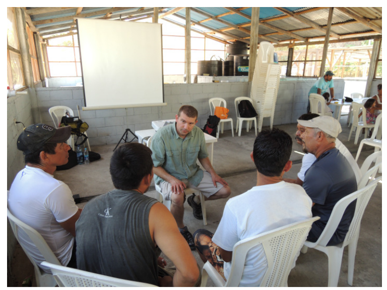
Fig. 4 PICES MarWeB researcher (facing camera) conducting the follow-up semi-structured interview with families from Monterrico, Guatemala.

A mission to Guatemala City and two Pacific coastal towns (Las Lisas and Monterrico) was undertaken from February 26–March 7, 2015 to implement the social survey. These surveys were conducted with approximately 20 families in each of these two coastal towns, using a set of 34 questions with 5 possible answers from a computer to provide anonymity to the respondents. The survey asked questions such as how often the family buys seafood from the market, and whether the ocean provides enough food for the family. The surveys lasted approximately 1 hour, after which students conducted a follow-up interview to explore responses in more detail (Fig. 4).