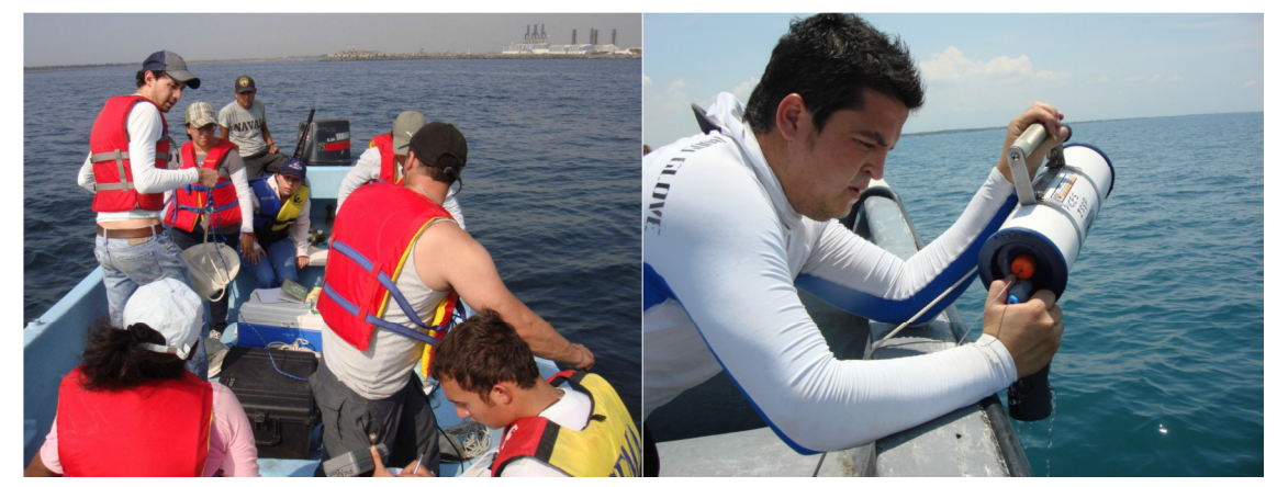
Fig. 3 Students and faculty from the Center for the Study of the Sea and Aquaculture (CEMA) of the University of San Carlos in Guatemala conducting water quality sampling for the oyster culture project and during currently ongoing harmful algal bloom monitoring efforts along the Guatemalan coast.

The project is now ongoing. For the first three months, sampling is being done every 2 weeks, and then will switch to once a month for the next 4 months. The monitored parameters are dissolved inorganic nutrients, dissolved oxygen, salinity, temperature, light transmission and phytoplankton. The monitoring is being carried out by students and faculty using equipment previously provided by the now completed PICES International Seafood Safety Project (ISSP) also funded by MAFF (Fig. 3). That PICES ISSP project provided training in identifying harmful algal species and measuring the toxicity of seafood exposed to toxic algae.