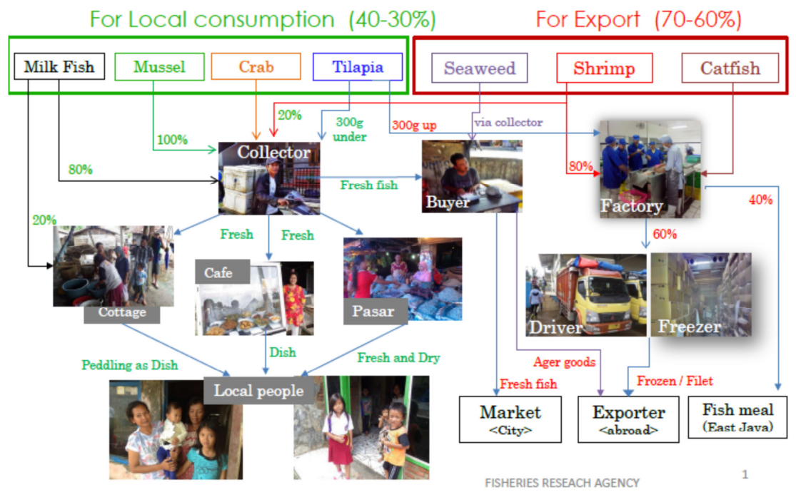
Fig. 2 Commodity chain of the IMTA products in Karawang area, Indonesia (revised).

the performance of the long-line shellfish culture system in La Barrona estuarine lagoons; determining yield potential of the culture system, including growth rates and time for mollusks to reach market size; evaluating shellfish survival rates during different phases of their growth and assessing mitigation methods against predation; adapting or developing culture practices appropriate for the management of the system; producing oysters that conform to the microbiologic standards of food safety; and assisting in finding suitable markets for the sale of the final product.