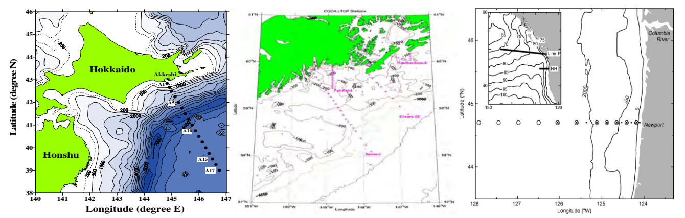
Fig. 2 Maps showing the location of the three MEMIP test bed locations: the A-line off Hokkaido Island, Japan (left), the Gulf of Alaska (GAK) line off Seward Peninsula, northern Gulf of Alaska (middle), and the Newport Hydrographic (NH) line, off Oregon, U.S.A. (right).

goals of MAREMIP and MEMIP seemed complementary and not redundant or duplicative.