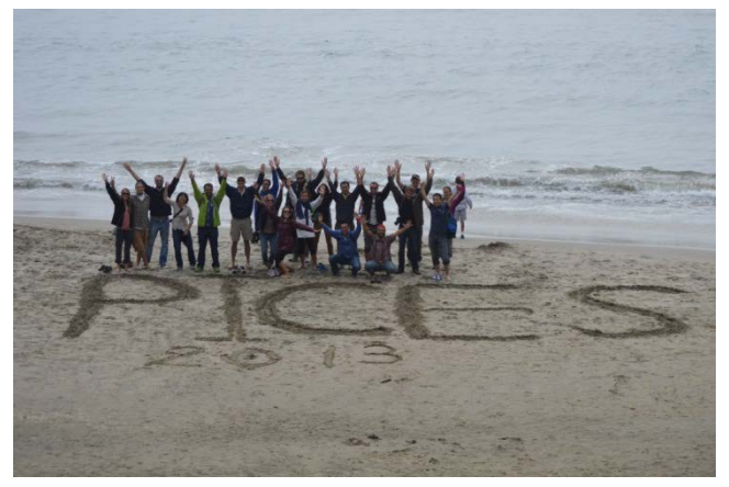
Photo 7 A way to say "Thank you for the wonderful experience" from our next generation of oceanographers.

The Summer School participants enjoyed meeting and collaborating with other young scientists from around the world. The working groups of about eight enabled close relationships to develop among participants. Discussion and camaraderie continued beyond the classroom and laboratory, with several evenings filled by informal gatherings and friendship. As one student put it, "the opportunity to interact with international students has been not only an excellent occasion to exchange views on each other's work, but also a perfect time to create new relations for future collaborations."