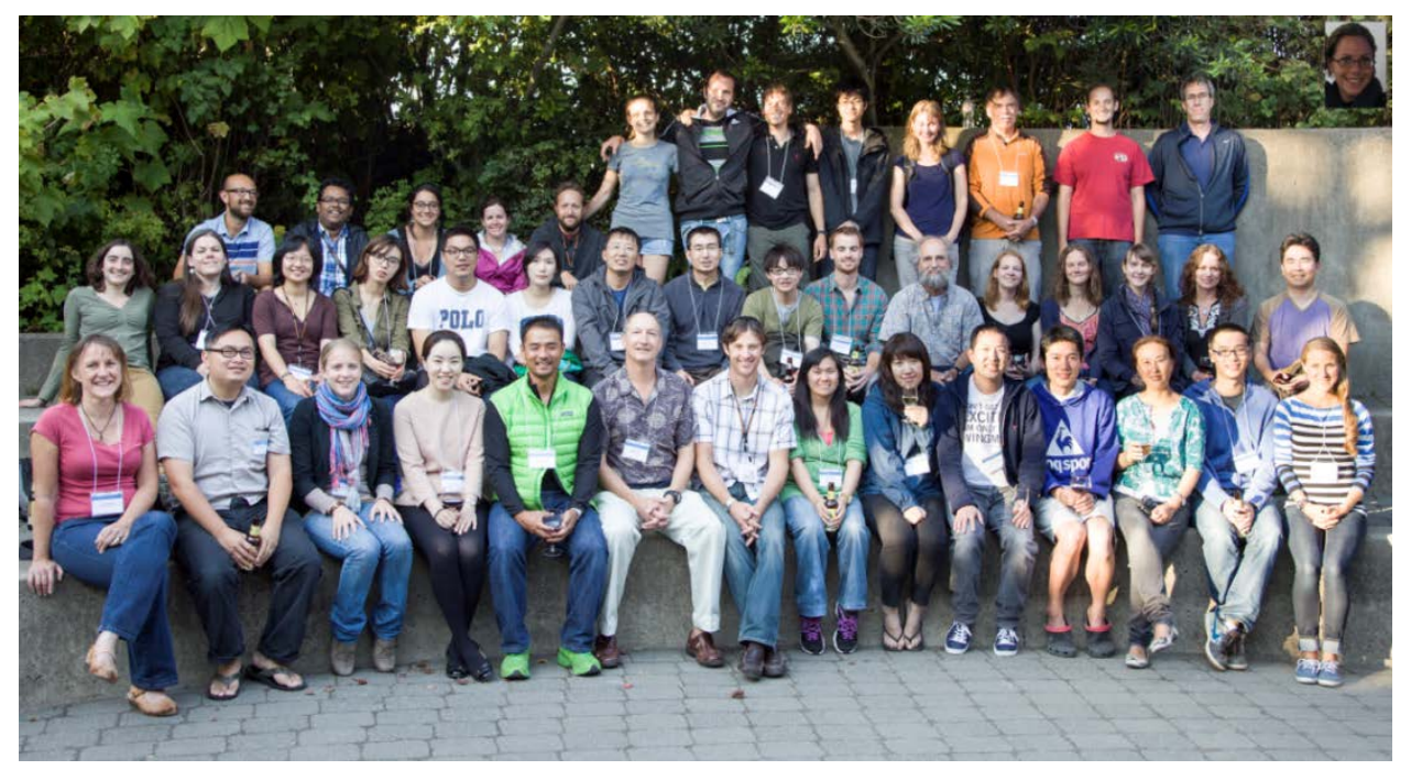
Photo 1 Participants in the PICES 2013 Summer School on "Ocean Observing Systems and Ecosystem Monitoring" (August 19–23, 2013, Newport, Oregon.