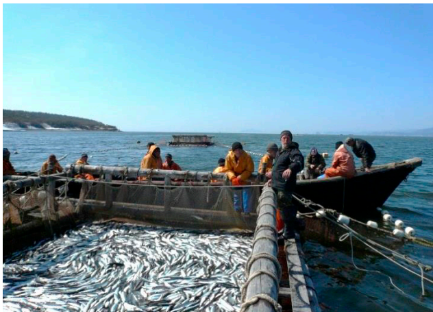
Fishermen in Aldoma Bay.

The Russian Far East coast is mostly occupied by small cities and settlements, with the majority of the population in these settlements engaged in fisheries. These people and small ethnic groups historically consider the ocean and its products as a source for provision and survival, as fishing is an essential part of people's daily life. Conversely, people residing in big cities far from the coast are generally more concerned, and value more the tendencies in the economy, such as the development of the fishing industry, and coastal recreational and cultural services. People with higher education level have higher expectations. However, both coastal and inland communities are dependent upon conservation of marine biodiversity and an opportunity to obtain marine ecosystem products.