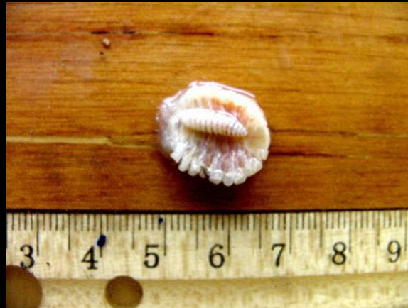
Griffen's Isopod - Orthione griffenis