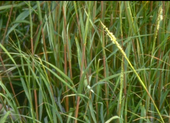
Cordgrass - Spartina species