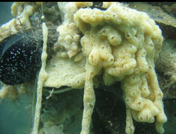
Sea Squirt - Didemnum lahillei